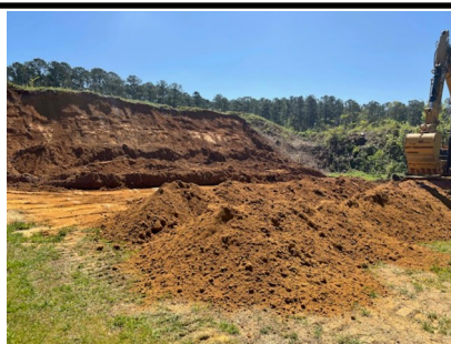
Berm Redevelopment Phase