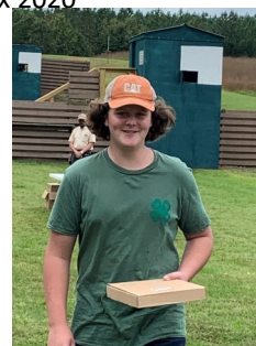
Walking away with 1st