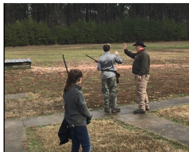
Trap Shooting February 2019

In the 2020 State Shotgun Championship held at brushy Mountain Club, he shot a 24 out of 25 in Trap, a 20 out of 25 in Skeet, and a 34 out of 50 in Sporting Clays for an overall score of 78. He won first place in Trap outright, tied for first in Skeet, and tied for second in Sporting Clays.