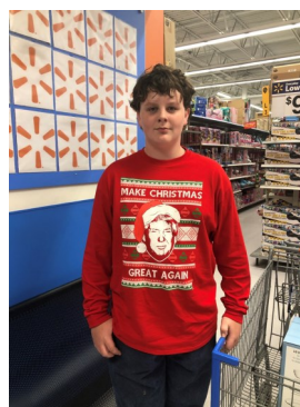
After Christmas Ammo Sale 2019